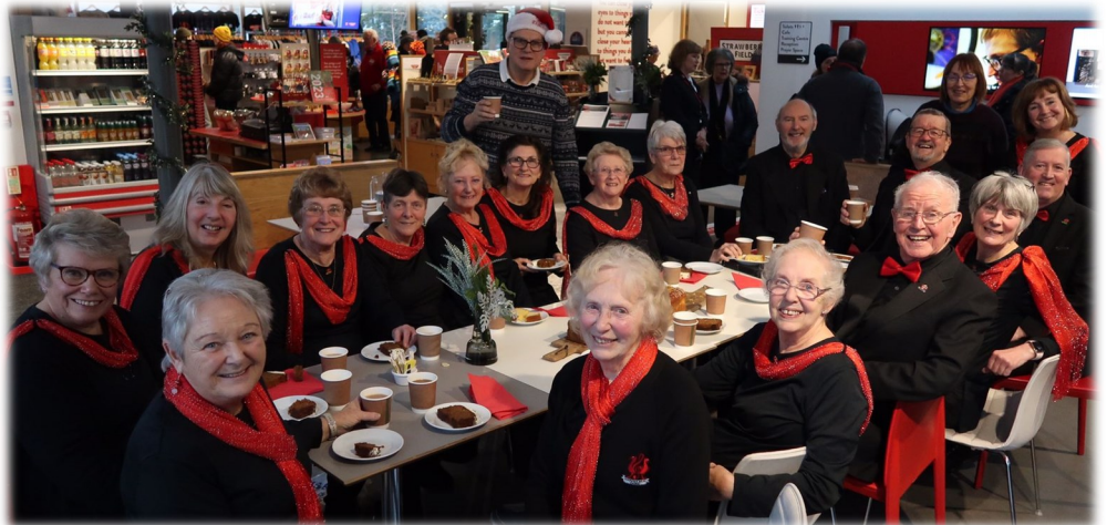
Enjoying a well deserved piece of cake at the Strawberry Fields Café!

During 2021 we made contact with Strawberry Fields which gained world-wide fame following the release of the Beatles 1967 single "Strawberry Fields Forever." John Lennon had grown up nearby, and had played in the grounds there as a child, which was formerly the site of the Salvation Army children's home. It was arranged that a group of our choir would sing there at a Christmas lunch in December 2021. However due to the number of Covid cases at that time, the venue cancelled at short notice, much to the disappointment of those who were going to sing.