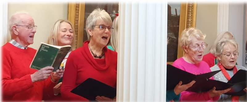
A small sub-section of the Choir singing a Welsh carol.

The Liaison team kept in contact with the management and we rescheduled to sing on December 13th 2022 at a special Christmas meal which was taking place on that day. This was a very enjoyable occasion, and we had some very positive feedback from all who were listening including some of the cast of 'A White Christmas' who were performing at the Empire theatre in Liverpool and had come to visit the venue. The most noteworthy audience members were 'Sinbad' from Brookside and Judy Garland's daughter Lorna Luft!!